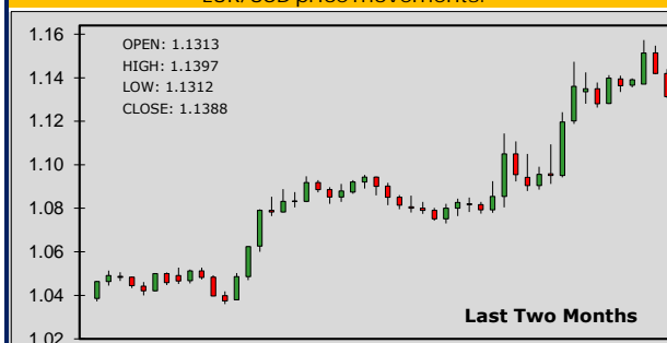
EUR/USD price movements: